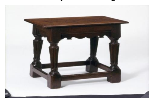
A "joined' stool gets its name from the fact that proper "joints" were used in making the stool.

The hall was a rather prestigious place, with even a painted cloth as a wall hanging. It contained a cupboard, a long table, two benches, four chairs, five joined stools and twelve